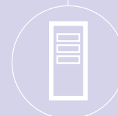
Computer network utilized to communicate with clinical lab