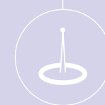
Local access point to receive data