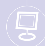
Monitor/record data at the clinical workstation