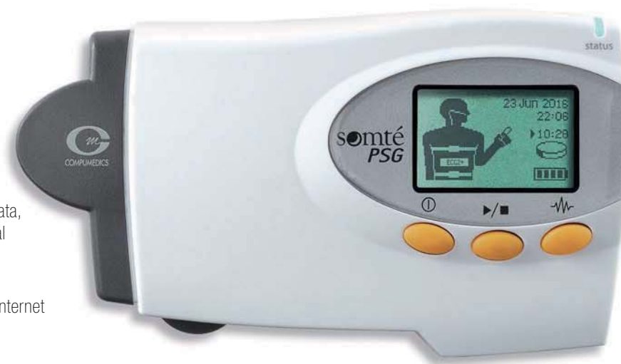
Pictured actual size