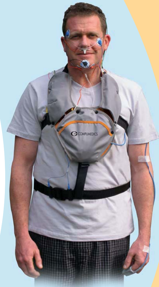
Optional EZ Vest for use with Somté PSG

Since 1987, Compumedics Limited has emerged as a world leader in the design, manufacture, and sales of diagnostic sleep, neurophysiology, research and transcranial Doppler systems. Compumedics design expertise in the area of portable physiologic recorders and wireless data transmission is just one reason for our continued growth. Compumedics is improving people's lives through innovative products, exceptional service and a full range of consumables and accessories brought to you by dedicated people who care.